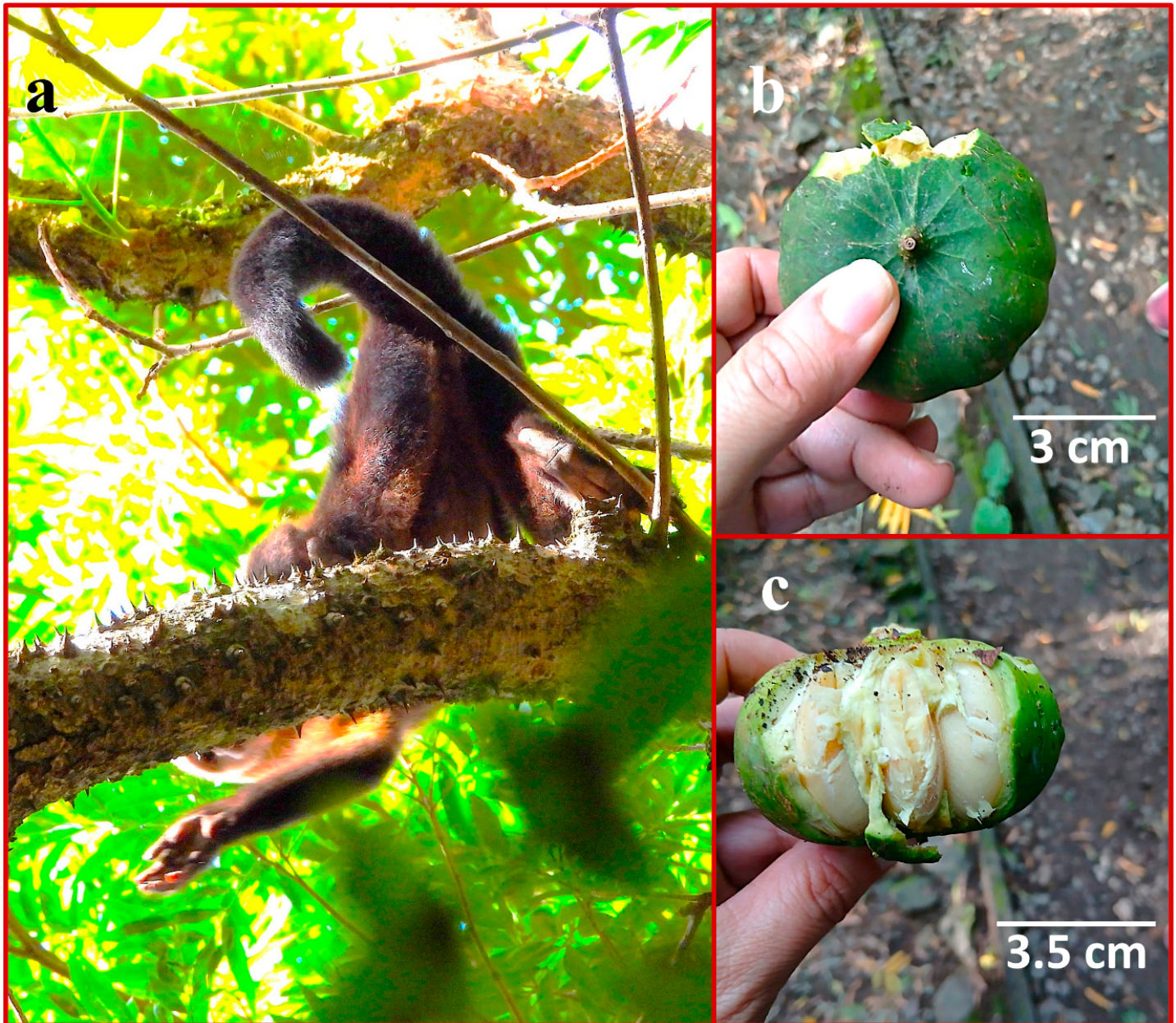
Figure 4. a) Capuchin monkey, Cebus capucinus , on a branch of a jabillo tree, Hura crepitans . b) and c) Two views of a jabillo fruit dropped by the capuchin. Rincón de la Vieja National Park, Liberia, Guanacaste, Costa Rica.

are also covered in fine hairs (González 2007). These fruits are longer than they are wide and are densely pubescent, with trichomes that range from yellow to golden brown (González 2007).