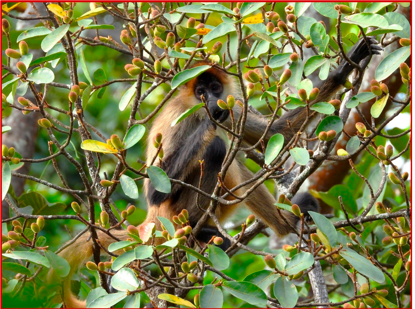
Figure 3. Section of the Ficus popenoei tree where a spider monkey, Ateles geoffroyi, was observed feeding on figs in Rincón de la Vieja National Park, Liberia, Guanacaste, Costa Rica.