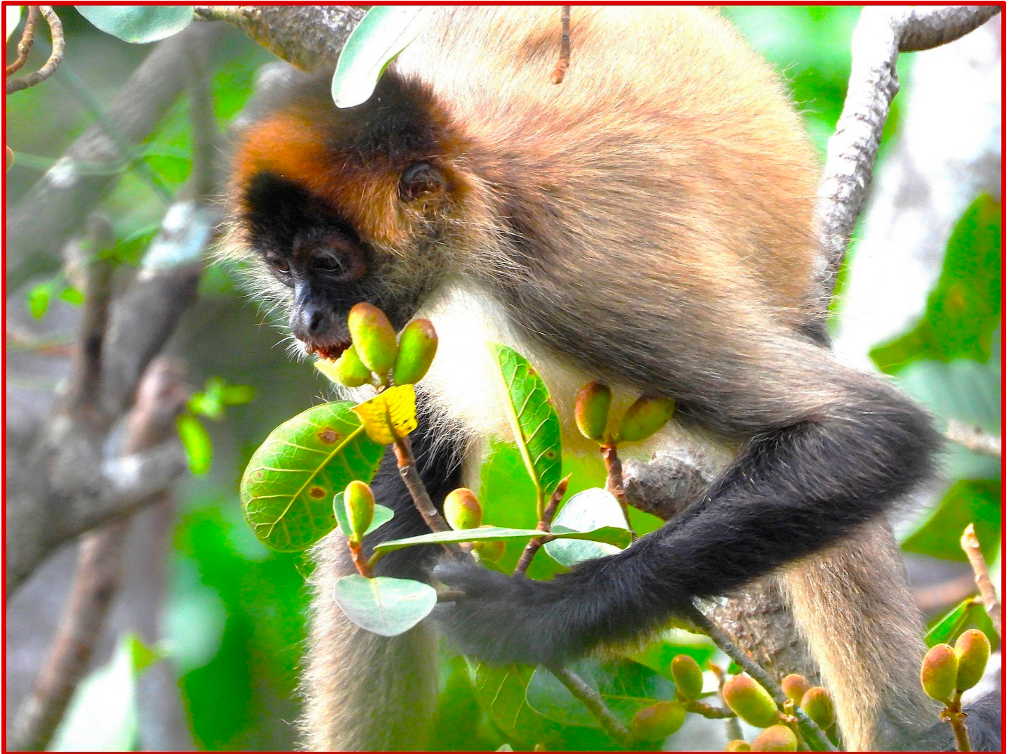
Figure 2. Female spider monkey, Ateles geoffroyi , feeding on Ficus popenoei figs in Rincón de la Vieja National Park, Liberia, Guanacaste, Costa Rica.

Mittermeier 2013 ). In tourist-impacted areas, the species is known to modify its foraging patterns and increase intake of human-derived foods ( Schulte et al. 2020 ). Although highly omnivorous, fruit is often the principal dietary component during fruit-rich seasons, while animal prey and other plant items supplement the diet at other times ( Rylands and Mittermeier 2013 ). Capuchins have been documented feeding on a variety of vertebrates, including amphibians, reptiles, birds, and small mammals ( Mora et al. 2024 ). Through their frugivory, capuchins serve as important seed dispersers across tropical forests ( Wehncke et al. 2004 ; Mora and López 2026 ).